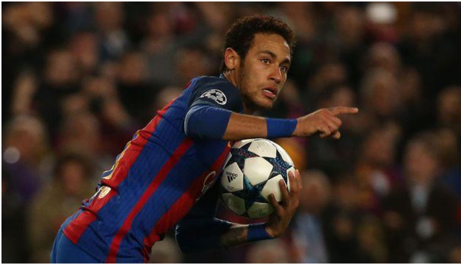
L'attaquant brésilien Neymar évolue au FC Barcelone depuis l'été 2013.